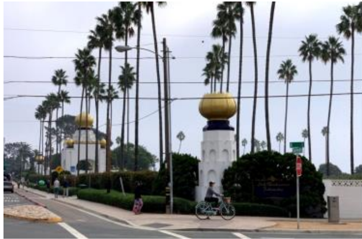
Photo 1: Golden Lotus Flowers top the towers along Highway 101, symbolic of a person's journey into self-realization ("Christ consciousness").