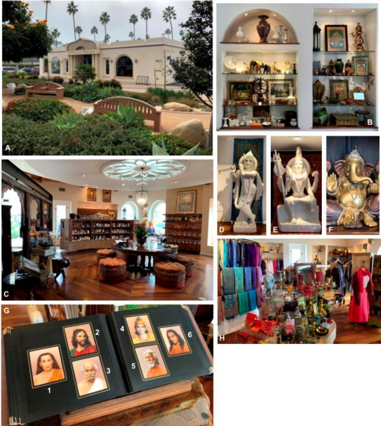
Photoset 4: The Self-Realization Fellowship Bookstore (A) reveals that what Yogananda brought to the United States was nothing other than Hinduism. In addition to clothing (H), various Hindu gods are available for purchase (B) including Krishna (D) ($4,900), Shiva (E) ($1,000), Buddha and Ganesh (F). The album (G) in the reading room (C) shows Jesus among many other enlightened ones. From left to right they show Babaji (G1), Jesus (G2), Lahiri Mahasaya (G3), Krishna (G4), Yuktswar Giri (G5) and finally Paramahansa Yogananda (G6).