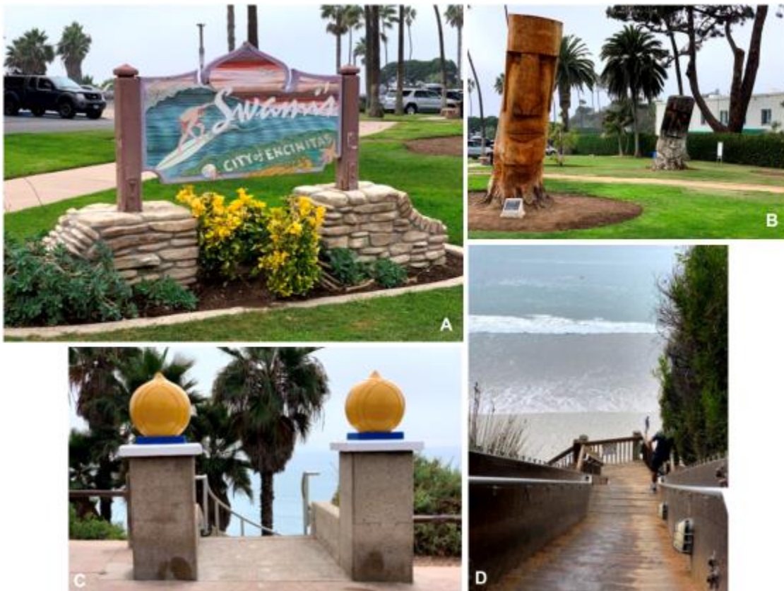
Photoset 2: Swami's Beach (A), just to the south of the Self-Realization Fellowship in Encinitas. Buildings for retreat-goers and resident hermits can be seen beyond the Easter Island Heads (B). A walk through the Lotus Flower stairway (C) leads to the beach below, a favorite surf spot (D) in San Diego.